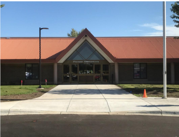
Main entrance to Pioneer. Buses drop off and pick up here. Visitors also must use this door to get buzzed into the building during school hours. No parent drop off/pick up here.