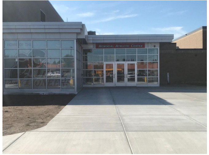
Healy students and 6th graders are released through these doors at the end of the day. This entrance is not open for student drop off in the mornings. Parents picking up students need to park, not stay in the fire lane. This is not a pick up lane.