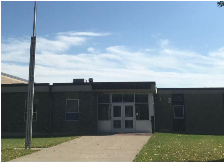
Door 2, also 'Main Entrance' for the high school and district offices. Visitors will use this entrance to be buzzed into the building during school hours.