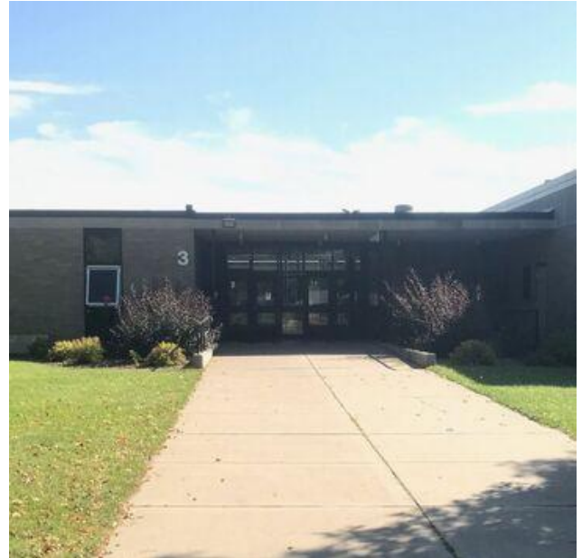
Door 3--the location for parents and buses to drop students. Please pull up to door 2 to avoid the buses. Do not park. Buses are using this area to drop students.