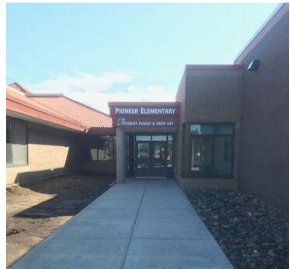
Middle School doors. Students who get dropped off will enter Pioneer through these doors. Parents who pick students up at the end of the day will use these doors.