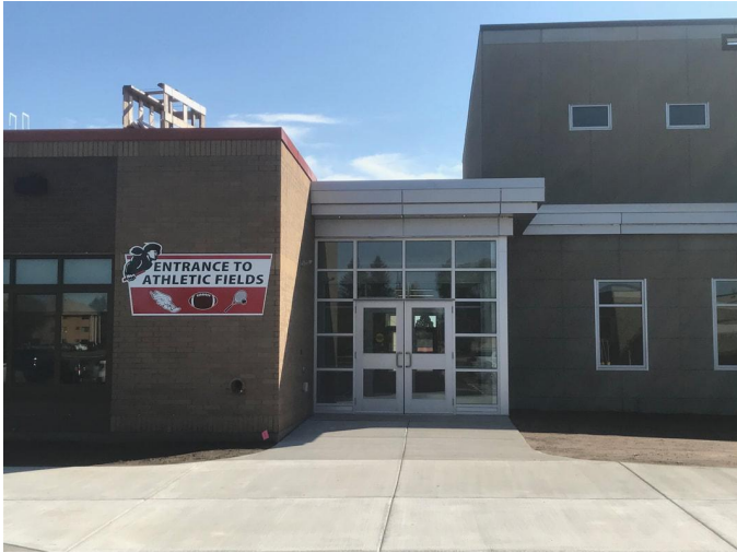
Athletic Fields entrance. This is a pass-through to tennis courts, track, and football. Spectators may park in this lot and walk through to the fields. Restroom/water facilities located here.